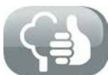
Environmental friendly (carbon neutral)